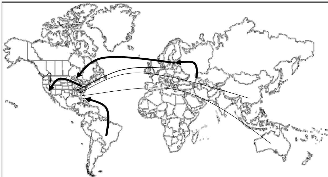
Figure 2. A growing list of ANS have made their way from Caspian Sea tributaries to the Great Lakes by way of canals connecting to Baltic tributaries and ship ballast water taken from Baltic harbors. Florida's invasive species are predominantly from tropical South America, but include species from other origins. Many native ANS have moved westward from the eastern United States through canals and, much more commonly, through human introduction. An exception, the rainbow trout, has been introduced from west coast origins both eastward and worldwide.

widespread include the sailfin catfish ( Pterygoplichthys multiradiatus ) and brown hoplo ( Hoplosternum littorale ) from South America, and the walking catfish ( Clarias batrachus ), bullseye snakehead Channa marulius , and swamp eel ( Monopterus albus ) from eastern Asia. Several species in the cichlid family are regarded as nuisances because of their threats to native species, including the spotted tilapia ( Tilapia mariae ) and blue tilapia ( Oreochromis aureus ) from Africa, and the Mayan cichlid ( Cichlasoma urophthalmus ) and black acara ( Cichlasoma bimaculatum ) from tropical America. A large predator of the same family, the butterfly peacock bass ( Cichla ocellaris ), was introduced to southeastern Florida from South America to control other cichlid species and to provide highly regarded sportfishing.