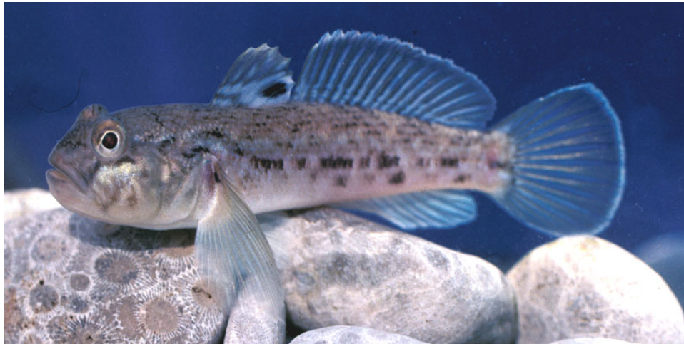
Figure 1. Round goby ( Neogobius melanostomus ).

BACKGROUND: The round goby, Neogobius melanostomus , a native of Eurasia, is spreading throughout the waters of North America (Figure 1). Native to the Black Sea and Caspian Sea systems, the round goby appeared in the St. Clair River, ONT-MI in 1990, and subsequently in the Great Lakes during 1993-1996 (Charlebois et al. 1997). Particular concern exists for the population in southern Lake Michigan and the Calumet River, which is spreading west via the Cal-Sag Channel towards the Des Plaines River (Moy 1997). Penetration by the round goby into the Mississippi River system, or any large river system, would allow virtually unlimited spread throughout large geographic areas. Its high rate of dispersal (e.g., all five Great Lakes in only 5 years) is particular cause for concern (Jude 1997).